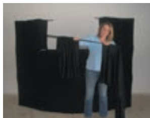
Straighten the curtain rod, slip the two curtains on to the ends of the rod.