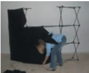
top squares of velcro, then the middle and then bottom.