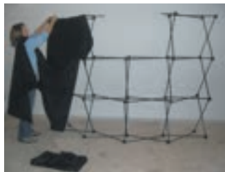
Begin at the stage opening and work your way to the top outside corner.