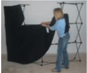
Work towards the center of the stage. Continue to line up the