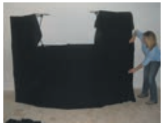
Secure the fabric covering at the corner hubs.