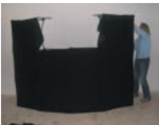
Pull the covering around the back edge, attaching to the velcro hubs in the back.