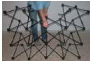
As the frame enlarges, begin pushing the square hubs together.