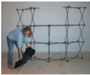
Remove contents of drawstring bag. Begin by applying the fabric cover.