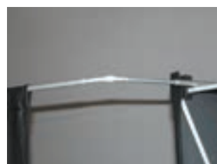
For larger puppets and stage opening, pull the curtain rod extenders out for more space.