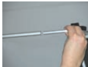
Insert the curtain rod into the other end of the L-shaped rod extender.