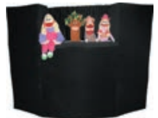
Now it's time to have FUN!