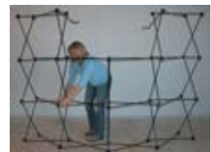
Once the frame is brought to the correct height (6'), connect the plastic hooks to secure it.