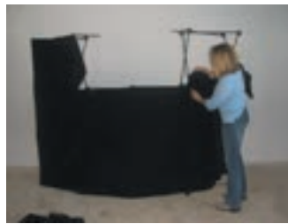
Work towards the other side of the stage, smoothing the fabric covering as you go.