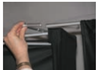
Repeat process on other side.