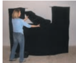
Unfold and place the playboard on the stage opening,