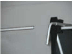
Insert the L-shaped curtain rod extenders into the open metal tubes of the stage.