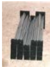
Folding metal frame