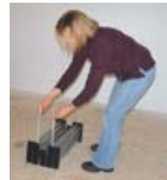
Lift the two loose metal tubes (curtain rod holders) upward and out of the way.