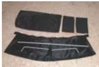
Drawstring bag: (fabric cover, 2 curtains, playboard, folding curtain rod, 2 L-shaped curtain rod extenders).