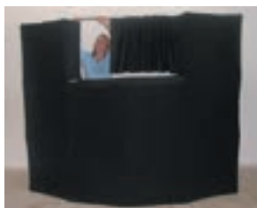
The depth of the stage area is adjustable.