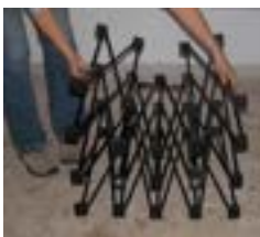
Pull metal frame apart using an outward and upward motion.