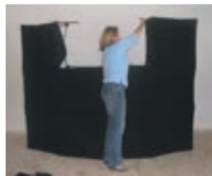
Attach the velcro of the side stage flaps to velcro hubs in the back.