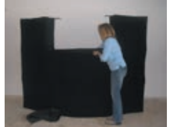
Attach the velcro to the fabric covering in the front of the stage and the velcro hubs in back.