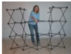
Grab a square hub on the outside, and one on the inside, and push together.