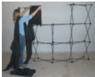
Apply the velcro of the cover to the corresponding velcro of the square hubs.