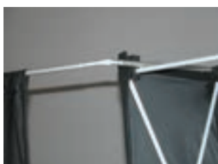
For average sized puppets, push the curtain rod extenders into the metal tube.